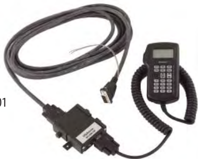
HHC Hit 250-5300-101