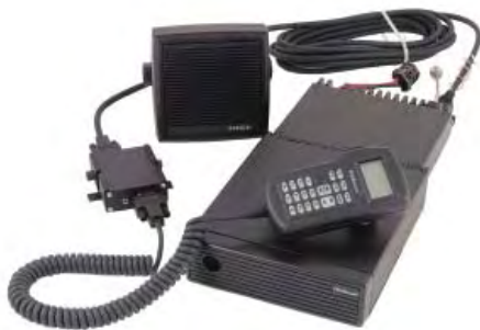
Handheld Controller shown with 5326 100-watt trunk-mount mobile and junction box. External speaker (PN 250-0151-005), also shown, is ordered separately.